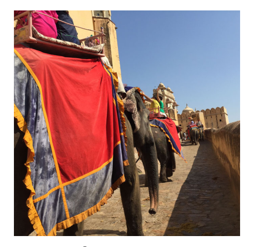
Amber Fort Jaipur

In the morning we first visit the Amer Fort in Jaipur. The famous Block Print Museum Anokhi is our next stop. In the afternoon we discover the exciting centre of Jaipur, The Pink City. Evening is at leisure.