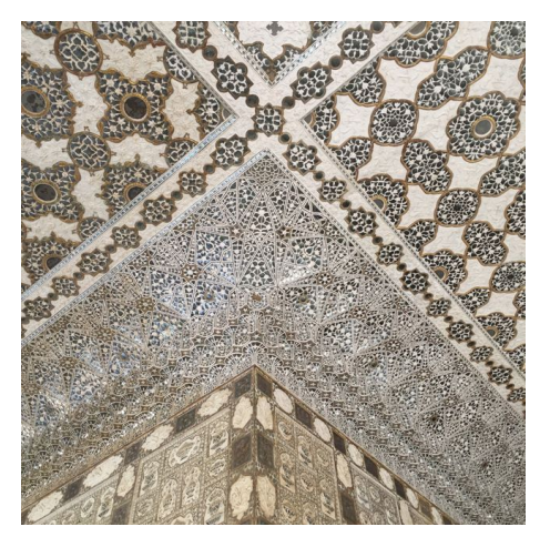
Amber Fort Jaipur