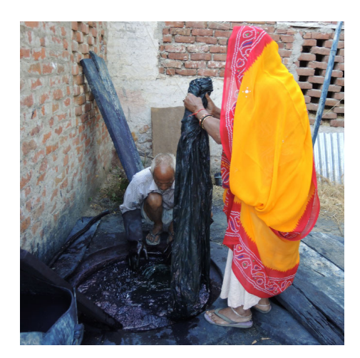
Indigo Workshop Bagru

We start our journey in the morning and will arrive in Jaipur in the afternoon. The first stop will be at the monkey temple Hanuman {\tt Ji} , {\tt Galtaj} . The evening is at leisure.