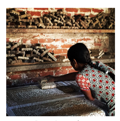
Blockprint Workshop Bagru