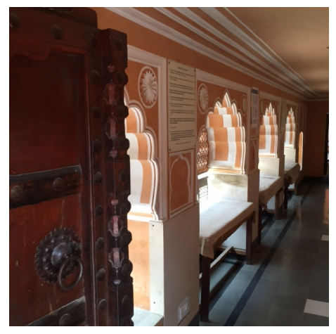
Anokhi Museum Jaipur